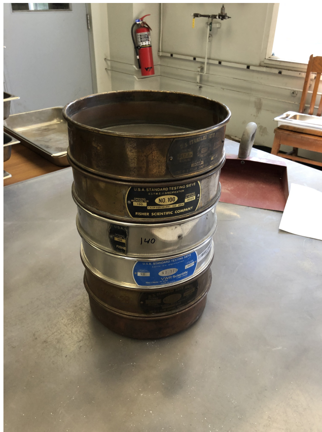
Figure 3: Sieves used for obtaining size distribution