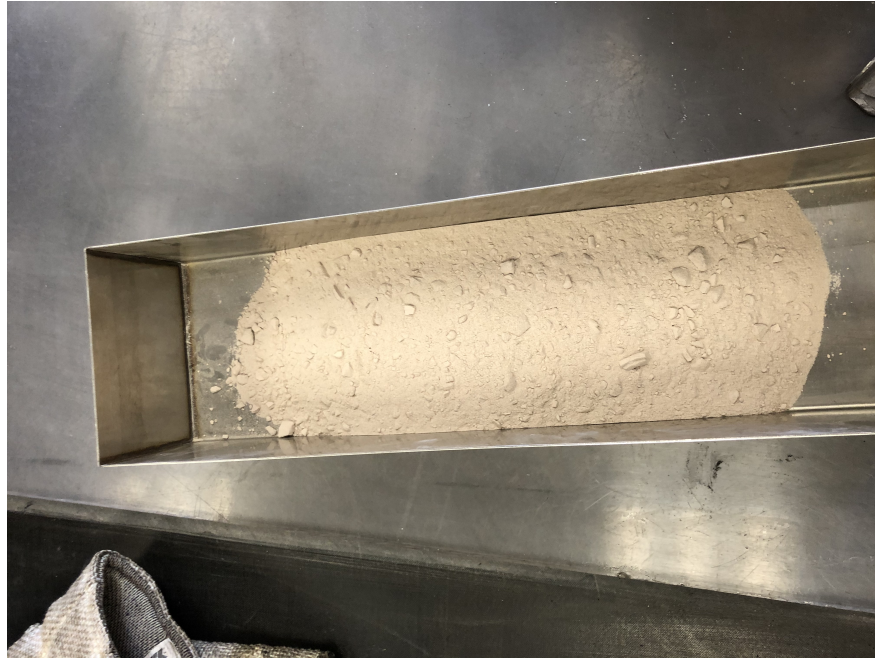
Figure 2: Chalcopyrite ore after splitting